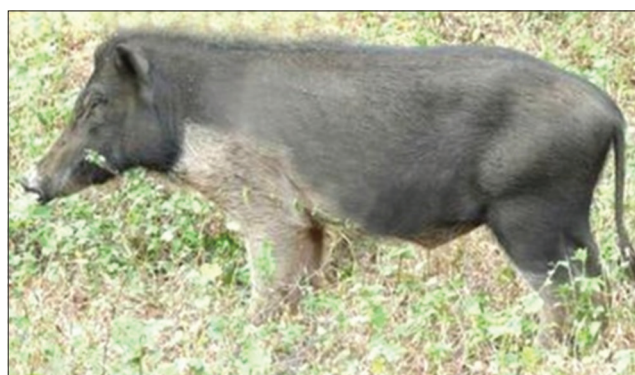
Figure-2: Non-descript male pig in a farmers herd at field conditions.