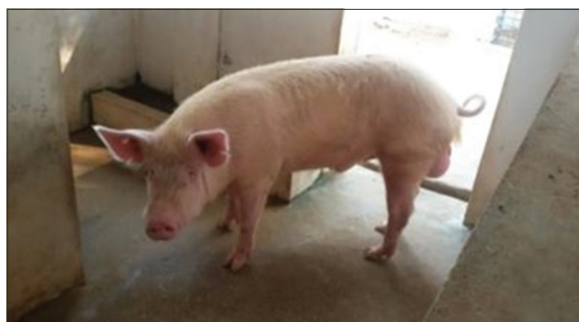
Figure-1: Large white Yorkshire crossbred male maintained in farm conditions (at all India Coordinated Research Project on pig, Tirupati).

In the present study, a total of 63 and 65 number of good metaphases were examined in LWY crossbred, and non-descript pig and a total of 168 and 143 NORs