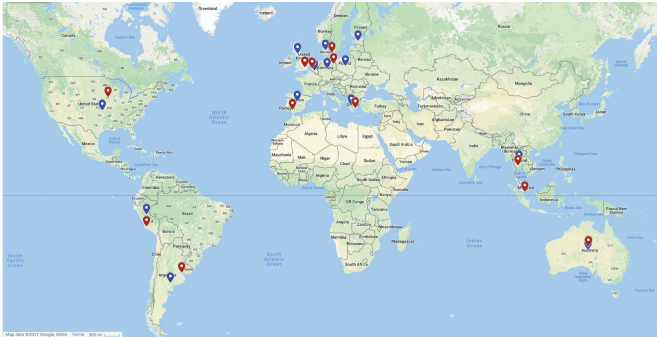
Figure 1. Map of International Network for Strategic Initiatives in Global HIV Trials influenza protocol patient intake sites. Blue markers indicate FLU002 outpatient sites and red markers indicate FLU003 inpatient sites.

to follow-up were treated as missing and removed from the analysis.