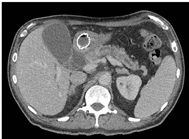
► Fig. 1 Computed tomography scan before endoscopic ultrasound-guided choledochoduodenostomy showed biliary tree dilatation with the duodenal stent in place.