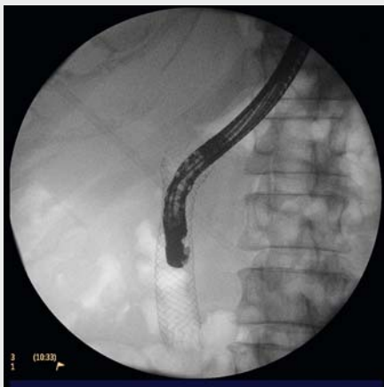
► Video 1 Endoscopic ultrasound-guided choledochoduodenostomy with a lumen-apposing metal stent through an uncovered metal duodenal stent