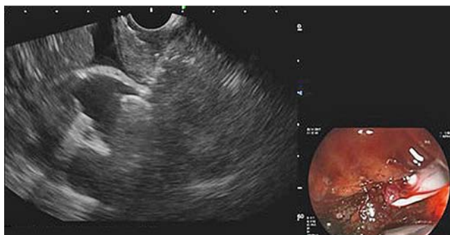
► Fig. 2 Endoscopic ultrasound-guided choledochoduodenostomy with the Hot AXIOS stent and deployment of the distal flange.