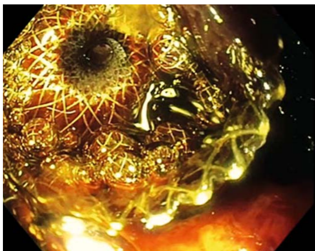
► Fig. 3 Endoscopic view of the lumen-apposing metal stent in the duodenum.