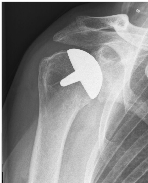
Fig. 1 Post-implant AP radiograph where all observers classified the size, inclination, and stuffing of the joint as anatomical

only moderate inter-observer agreement was reported. When comparing measurements from CT images and radiographs, the authors found a tendency to underestimate the LGHO on radiographs with a mean difference of 5 mm [12]. Another study by Thomas et al. also found low inter-observer agreement when measuring LGHO on plain radiographs. This was related to a systematic error with one observer locating the base of the coracoid more medially than the other. The authors concluded that their measurements of LGHO were unreliable [30]. In an attempt to minimize such systematic errors, Stilling et al. created a modified method of measuring LGHO. The measurements were done by a radiologist, and intra-observer agreement was reported as being high but no data on the inter-observer agreement was reported [29]. Based on these previous results, LGHO measured on plain radiographs does not seem like a viable method to evaluate the anatomical reconstruction or as a framework to define overstuffing.