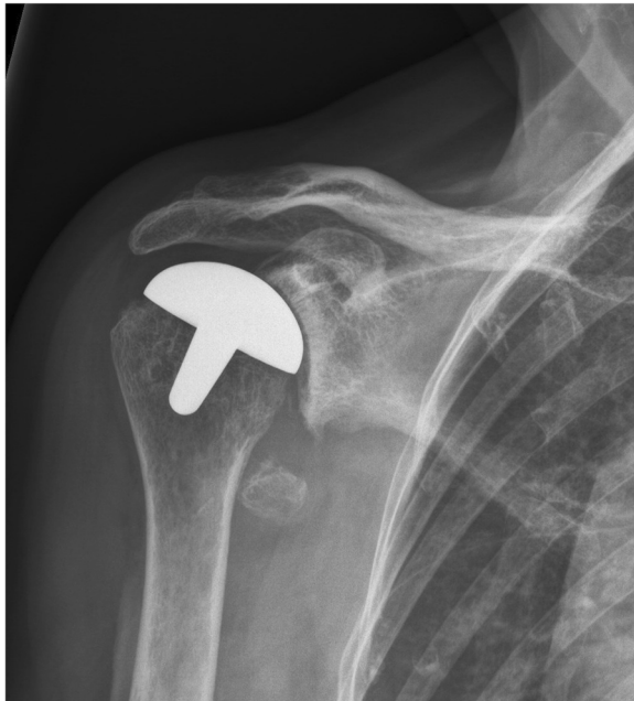
Fig. 4 Post-implant AP radiograph where all observers classified the inclination as being in valgus