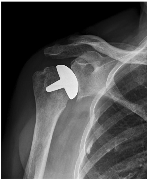
Fig. 5 Post-implant AP radiograph where all observers classified the size of the implant as too small

recognition pattern regarding overstuffing, implant inclination, and size of the implant following RHA does not exist and that each observer has their own subjective method of pattern recognition, especially regarding overstuffing. Therefore, a visual evaluation does not seem like a reliable method to define and assess overstuffing following RHA.