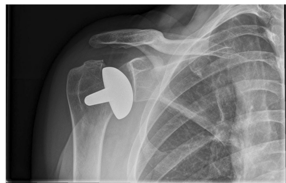
Fig. 3 Post-implant AP radiograph where all observers classified the inclination as being in varus

Based on the above, it currently seems that there are no reported methods of reliably assessing overstuffing following RHA, and thereby, no method of defining the term. Our study indicates that a uniform visual