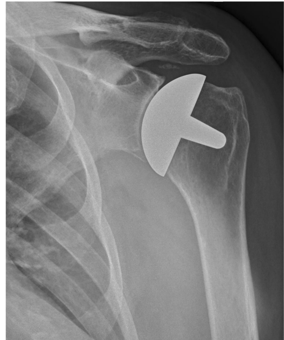
Fig. 6 Post-implant AP radiograph where all observers classified the size of the implant as too large