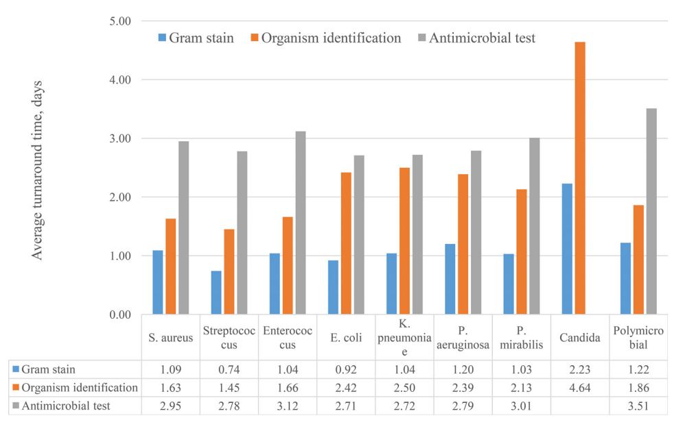
FIG 1 Average turnaround time by organism.

concentrated between 6:00 a.m. and 11:59 a.m. for Gram stain (43%), organism ID (78%), and AST (82%) results (P < 0.001), with the peak number of all reports between 7:00 and 8:59 a.m. (Fig. 3). When examining by hospital, 10 of the 13 hospitals reported Gram stain results throughout the 24-h period, and three hospitals reported these results only during the day shift (see Table S1 and Fig. S1 in the supplemental material). Organism ID results were reported throughout the 24-h period by only four hospitals (see Table S2 and Fig. S2). No hospital reported AST results throughout the 24-h period (see Table S3 and Fig. S3).