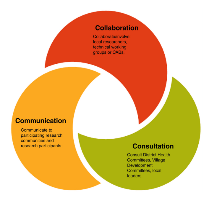
Figure 1. The 3 C's model of participatory community engagement.

1) Enhancing collaborative partnerships. In order to achieve genuine collaborative partnerships, workshop participants suggested that various community representatives should be engaged as early as possible and at different levels of the research. During protocol development, local researchers who have an understanding of scientific research, government technical working groups, or community advisory boards (CAB) should be engaged to ensure that the research is relevant to the community and that participating research communities are protected from harm. The CAB should include people who have been