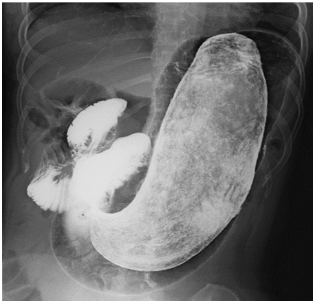
► Fig. 1 Upper gastrointestinal series, showing a giant mass consisting of foreign matter, measuring about 290 × 100 mm. The mass was associated with calcification and occupied the entire stomach.

gastrointestinal endoscopy (► Fig. 2 ) confirmed the presence of a giant gastric trichobezoar extending from the gastric cardia to the gastric angle.