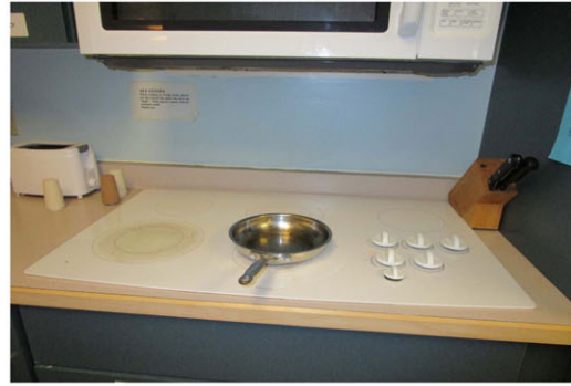
B. No more cooking as the new normal.