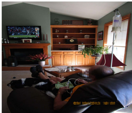
E. Continuing to enjoy one's daily activities while receiving HEN.