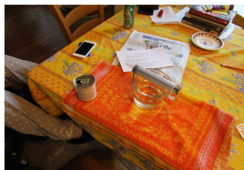
B. An early system derived by the family showing assembled materials used for delivering HEN