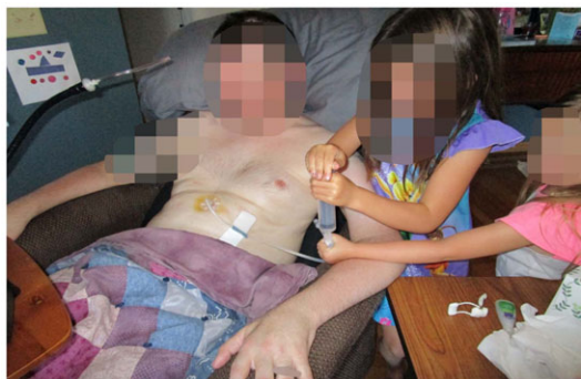
A. Delivering HEN is a family activity that can involve children

The caregiver role varied depending on how much the patient could do, what they needed assistance with, or how much involvement patients wanted in their care. Both photographs and interview narratives revealed that caregivers' physical tasks included helping prepare