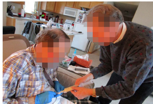
B. Brother of a patient delivering HEN as an act of care and love