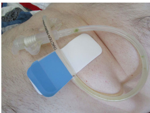
A. Being caught off guard by seeing gastric residue in the feeding tube

From a cultural anthropology standpoint, bodily orifices are considered to be particularly vulnerable points of the body that are surrounded by cultural rituals (such as eating and hygiene) that, when analyzed, reveal a culture's social structures, social relations, and practices. 27 In the case of HEN, the newly created stoma (the site at which the feeding tube enters the patient's body) featured heavily in the participant-generated photographs, and revealed intimate portrayals of the rituals of family involvement in the delivery of enteral nutrition, the additional care needed by those with severe illness, and the challenges of maintaining a healthy stoma site. Photographs and interviews conveyed both the mechanical or physical complications of the stoma site, such as a leaking tube or the tube falling out. Some HEN patients described the stoma as "sore," "swollen," and "infected" and reported bloating, constipation, diarrhea, and nausea which are gastrointestinal symptoms associated with tube feeding. Many participants were caught off guard by having food residue in the tube and wished to convey this to novice HEN patients and their caregivers (Figure 4A):