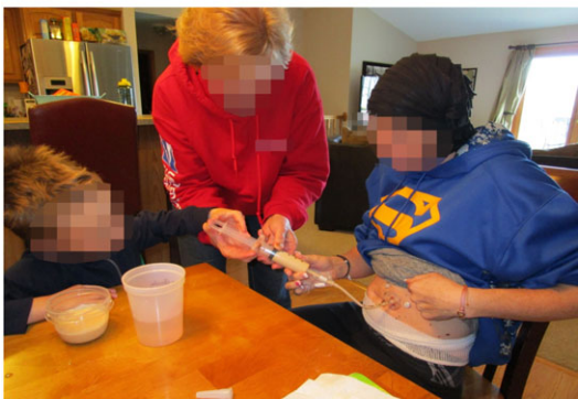
C. A child delivering HEN for the first time as a way of educating the child