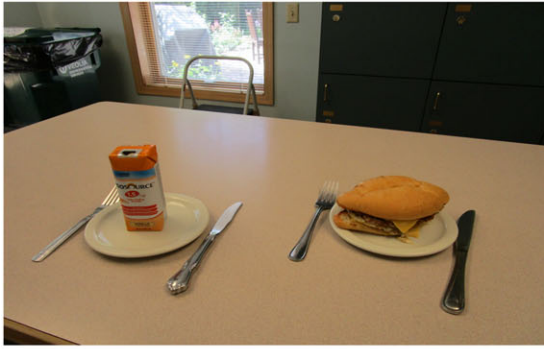
A. HEN formula as the "new normal" food