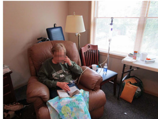
D. Multitasking with daily activities while receiving HEN