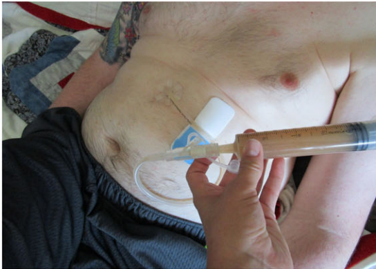
C. HEN as giving peace of mind through delivering a lifesaving therapy