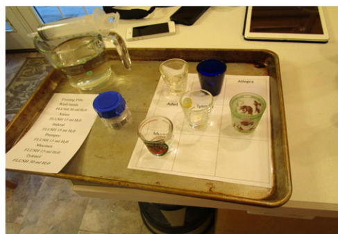
C. The cookie sheet system devised by a family showing how HEN materials are organized and assembled in readiness