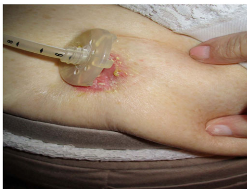
B. An infection of the stoma site

"... making sure they know it's gonna back up into the tube. I do not think that was something they [health care team] told us. We kind of figured that it would [back up], you know, with motion" (caregiver).