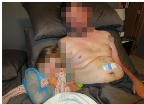
D. Young child showing affection through snuggles after delivering HEN