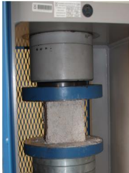
Figure 2. Test composite specimen in the device for determination of compressive strength.

absorption test was performed on these specimens by immersion in water for 1 h at 23 \pm 1 °C using the method of determining long-term water absorption specified in the standard [44].