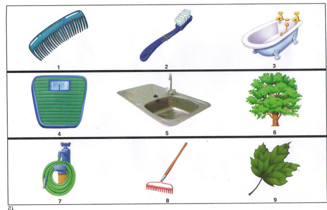
Fig. 1 Example trial from the Picture Concept Task. The subject has to identify the common association between one item from each row