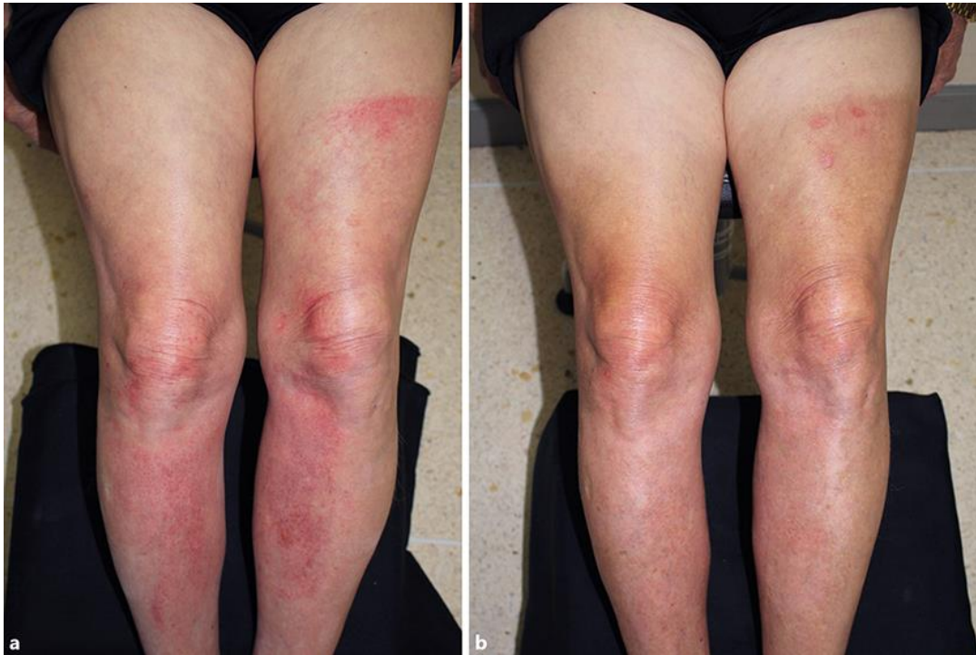
Fig. 1. Erythematous patches with pinpoint bleeding over the forehead, neck, and legs. a Note the clear demarcation line from the patient's shorts. b Resolution with postinflammatory hyperpigmentation.