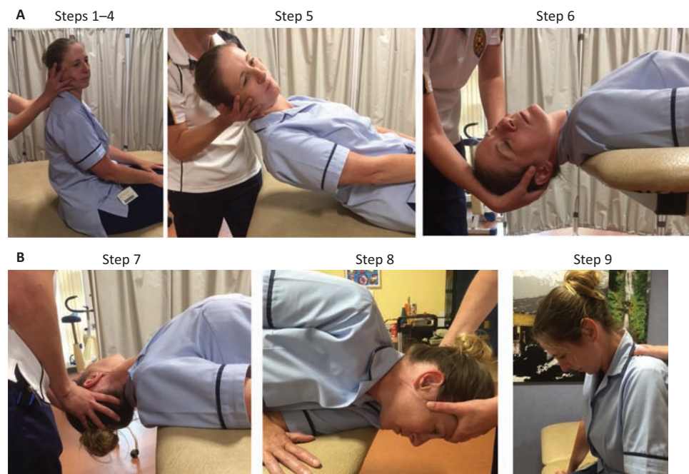
Fig 1. A – Dix-Hallpike manoeuvre. B – additional steps for the Epley manoeuvre.

from lying on their back to lying on their side with their head looking towards the ground.