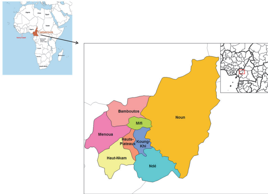
FIGURE 1: Map showing Bamboutos Division in the West Region of Cameroon.

clear picture of how diseases, particularly internal parasitism, are handled in pig husbandry. Knowledge on parasite control practices is also necessary to design strategies to mitigate the harmful effect of parasitism in livestock. Within the country, Bamboutos is known as one of the divisions where intensive and extensive pig farming are practiced [16], since intensive livestock production is commonly associated with high use of veterinary pharmaceuticals, such an area appear to be ideal to get a snapshot of both the internal parasitism and the associated control practices in the country.