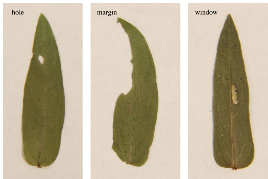
Figure 2. Different types of damage found on purple loosestrife herbarium specimens ( Lythrum salicaria ) in Quebec (Canada): hole, margin or window.