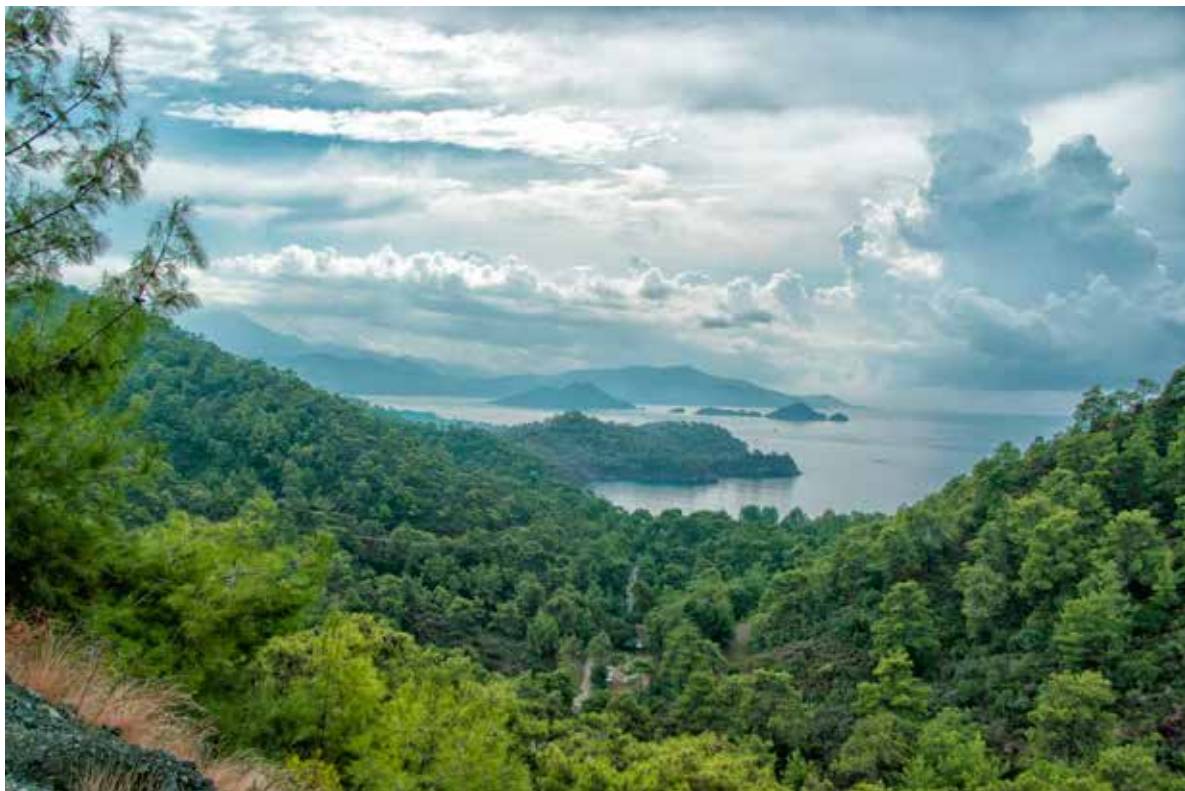
Ayla Bağ, from EFSAD's collections.