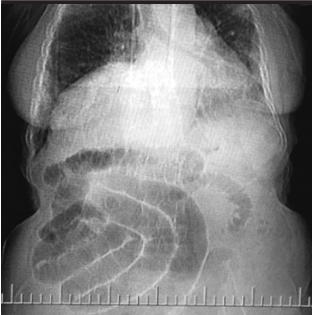
Figure 1. Coronal view of dilated loops of the small intestine on computed tomography