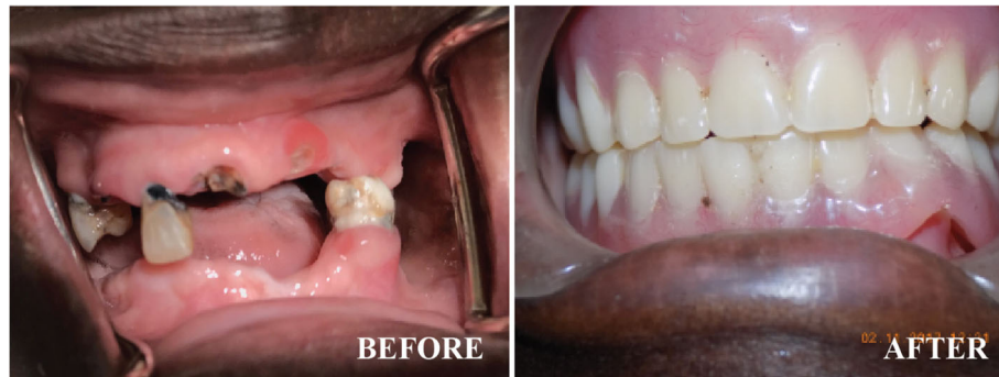
Fig. 3 Before and after complete dentures to restore feeding and cosmesis

normal microbial flora of the oral cavity [16]. It is also worth noting that this patient is on an ART regimen that includes tenofovir, which has been associated with loss of bone mineral density [17–20]. Whether what is seen in the long bones, joints and spine occurs in alveolar bone resulting in periodontal disease is an area that warrants research. Noteworthy is the fact that this patient's dental caries dated back before ART initiation, hence the need for well-characterised studies to understand HIV-and ART-related and un-related risk of dental caries to inform targeted prevention and care interventions.