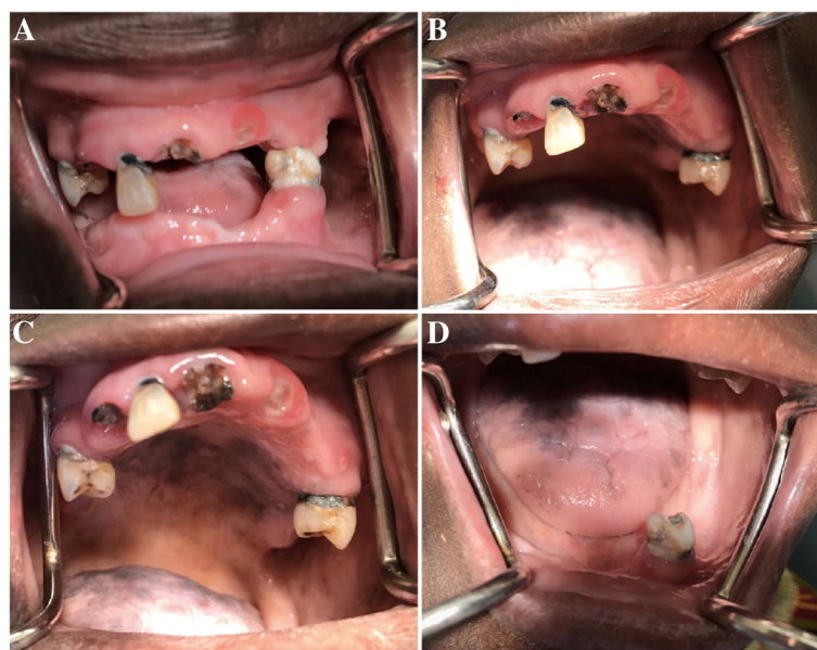
Fig. 1 A and B, show inflamed upper labial marginal gingiva, cervical caries of the remaining teeth and retained roots secondary to caries. C and D, show diffuse blackish-purple pigmentation on the hard palatal surface and dorsum of the tongue probably secondary to ART or Kaposi's sarcoma

On general examination, she was in fairly good general health condition without pallor of the mucous membranes, yellowing of the sclera or palpable cervical lymphadenopathy. The face was symmetrical with prominence of the zygomatic bones, sunken cheeks and mandibular prognathism, features associated with tooth