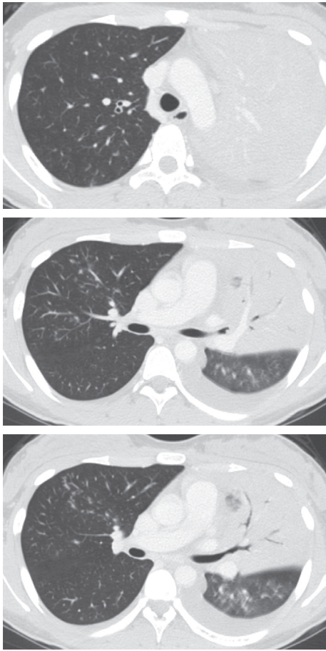
FIGURE 3: Chest computed tomography image on day 5 showing extension of the consolidation areas with air bronchogram in the left upper lobe and opacities in the right lung.

pathogens, it should still be considered as one of the causative pathogens in influenza virus coinfections.