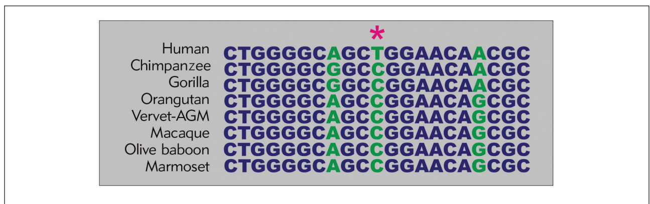
Figure 1 Multiple sequence alignment for rs2292832 and flanking sequence.

CAD under four genetic models (co-dominant, dominant, recessive and over-dominant). The AIC (Akaike's information criterion) was calculated to choose the most appropriate model of inheritance. Accordingly, the recessive model was the best fit for the inheritance model with the lowest AIC for rs2292832. Our analysis revealed that the TT genotype was more frequent in CAD patients than controls ( P=0.02 ; OR=1.88 ; 95\% CI: 1.04-3.38 ) under the recessive model.