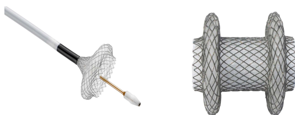
Lumen apposing metal stent (LAMS)