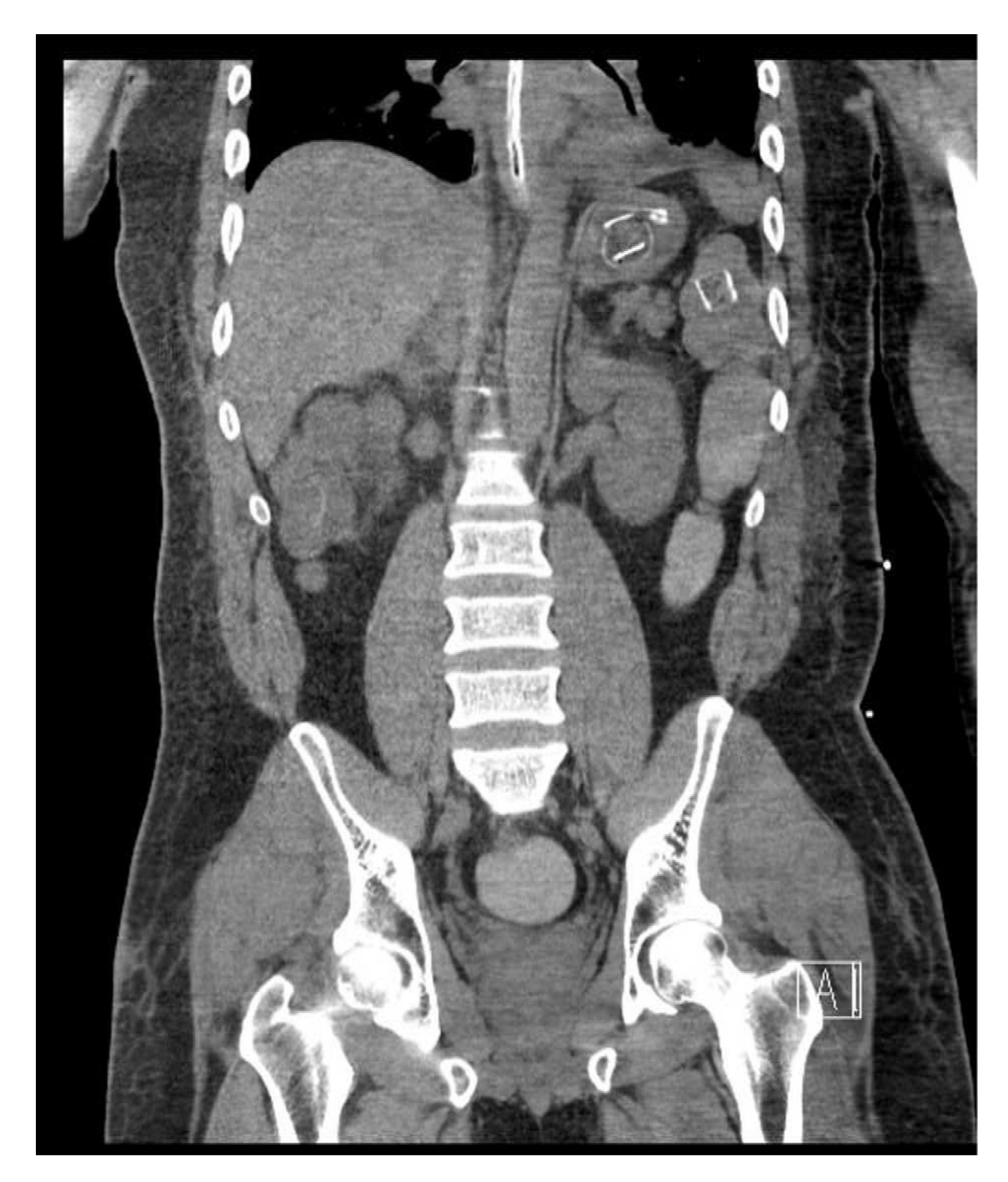
Figure 2. Packets Identified on CT Scan. Initial CT of the abdomen demonstrated0 twopackets in the body of the stomach, one in the small bowel, and two in the colon.