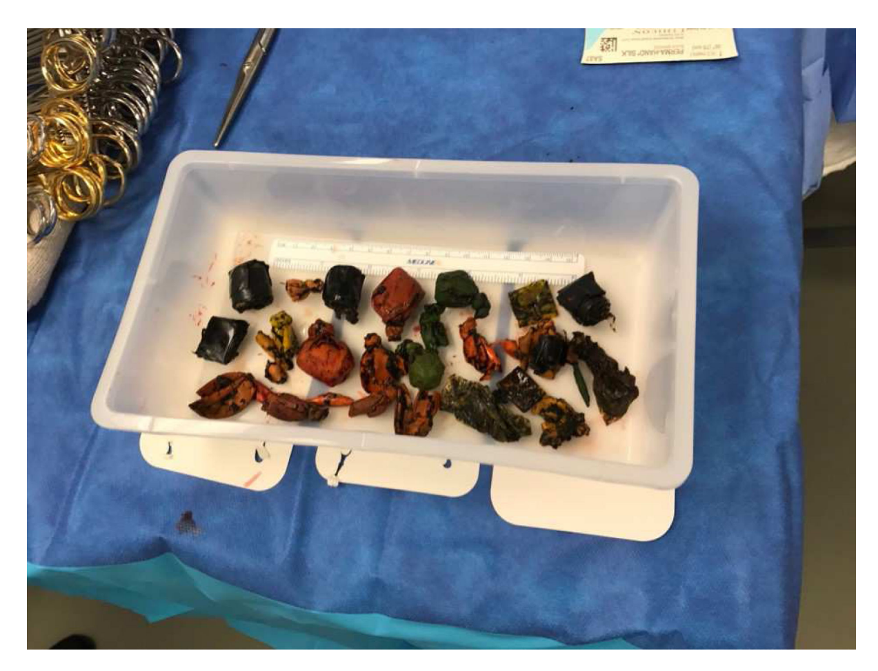
Figure 3. Packets Removed During Exploratory Laparotomy. Contents removed included 22 poorly wrapped packages of balloon and electrical tape containing green, leafy organic material.