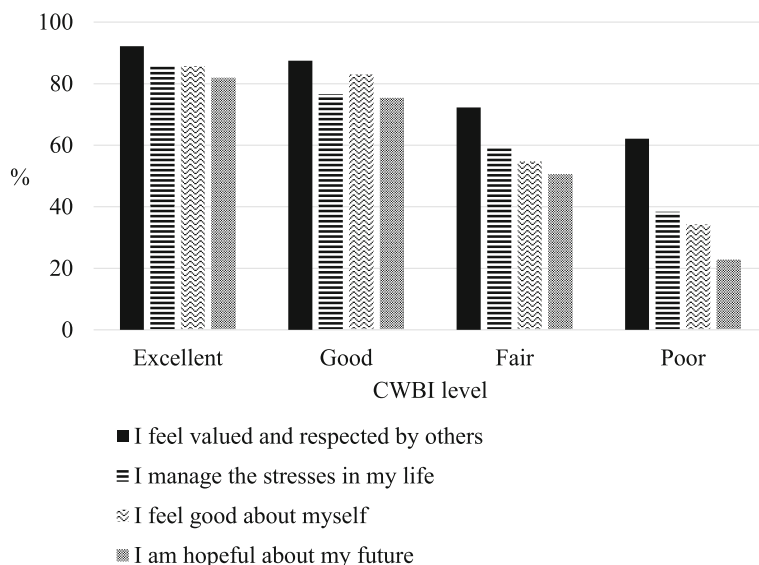
Fig. 2 Caregivers report that 'always, or most of the time': 1) feel valued and respected by others; 2) manage the stresses in their life; 3) feel good about themselves; 4) are hopeful about their future

The screener differentiates levels of wellbeing linked to positive and negative aspects of caregiver lives. This is in agreement with other studies [64] but it also has other important implications. Since wellbeing has a protective role in health maintenance and poor wellbeing is associated with impaired health [8], the screener may be used to identify caregivers that would benefit from target interventions or preventive measures, using only four items. According to Dodge et al. [6], wellbeing is related to the psychological social, and physical resources that someone has to address as a result of challenges on these aspects of their lives [6]. Thus, caregivers can achieve wellbeing by