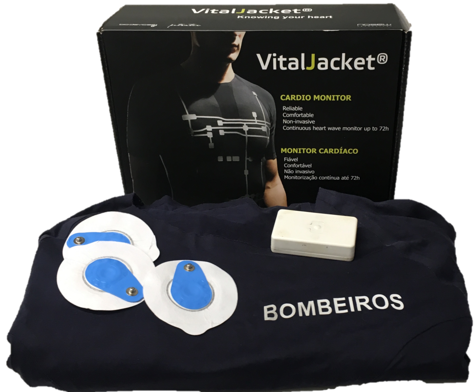
Figure 2 Vital Jacket® equipment.