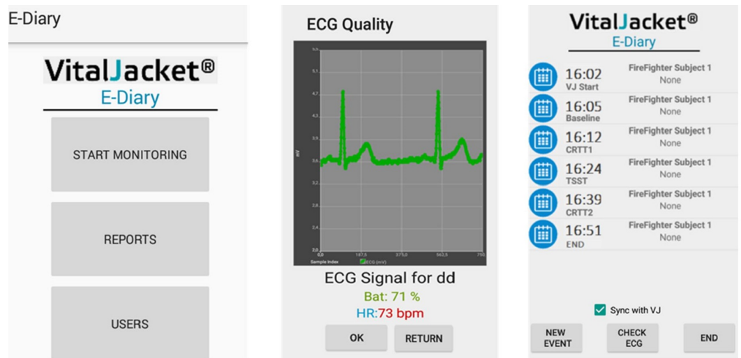
Figure 3 Smartphone application layout.