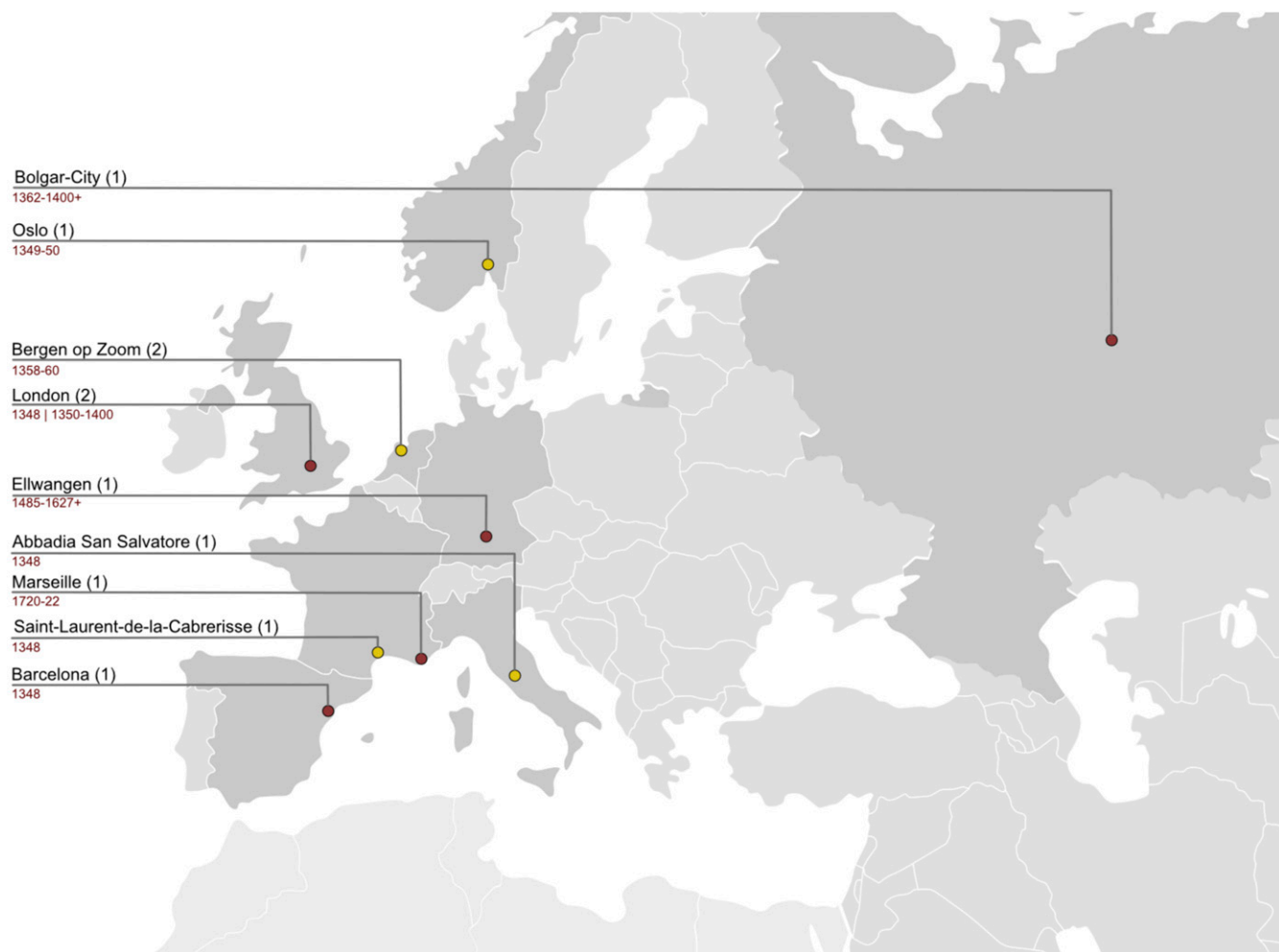
Fig. 1. Geographic locations of previously and presently described ancient genomes. Map of previously and presently described ancient genomes. The red circles represent the locations of previously described ancient genomes. Yellow circles represent ancient genomes described in this study. For the newly described ancient genomes, the indicated years are discussed in Results and Discussion . Numbers in parentheses indicate number of ancient genomes included from each site.

study can improve the resolution of the Yersinia pestis phylogeny and can contribute to the discussion on transmission routes and reservoir establishments during historical pandemics. Using state-of-the-art bioinformatics methods, we evaluated the evolutionary history of Y. pestis by incorporating the data reported in this study into a revised phylogeny. We evaluated our results in light of historical, epidemiological, and ecological studies to improve our understanding of the fully documented spectrum of the dynamics at work during the early decades of the Second Plague Pandemic.