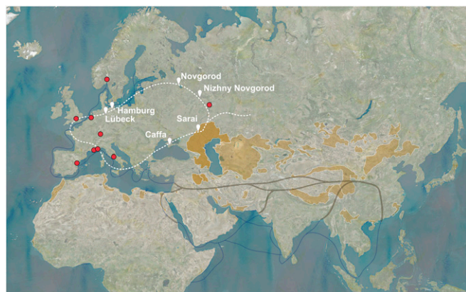
Fig. 4. Schematic representation of the connection between the fur trade routes and the spread of plague during the early stage of the Second Plague Pandemic (14th century). This simplified map shows cities strategically situated along the fur trade routes (indicated as a white line). The city of Novgorod (Russia) has played a central role in fur export to cities like Hamburg and Lübeck. The regions highlighted in orange represent known modern plague reservoirs. The darker orange delimits the region in which we believe secondary plague reservoirs were established before the Black Death. The red dots represent the locations of all known ancient Y. pestis genomes. Black lines, Silk Road; dark-blue lines, maritime trade routes.

trade routes, a complex network of interconnected maritime, riverine, and overland routes into Western Europe. During the second half of the 14th century, Bolgar and Novgorod (Russia) (Fig. 4) had established an economic dominance as major fur trade centers. Fur was historically an important trade good, which was widely commercialized on established itineraries all over Eurasia. Starting with the second half of the 13th century, Novgorod had gained access to the Western European markets through the Hanseatic League, which it eventually became part of (35). The flourishing of the League in the 14th century permitted Novgorod to export big consignments of fur to London via Lübeck and Hamburg (35, 38). Thus, the three specific SNPs found in London-ind6330 might have been acquired over the course of a more complex transmission chain, similar to Abbadia San Salvatore (Fig. 3B), since the territories of the Hanseatic League were also affected by plague during the pestis secunda (39). However, as plague also struck many Mediterranean ports between 1357 and 1361 (e.g., Alexandria in 1357–1358 and 1361, Venice in 1359–1361, Genoa in 1360–1361, and Ragusa/Dubrovnik in 1361 and Constantinople) (40), it becomes difficult to determine precisely the point of entry and the routes of transmission of the pestis secunda (40). However, a reintroduction from outside seems most likely both from historical (5) and climatic (10) evidence.