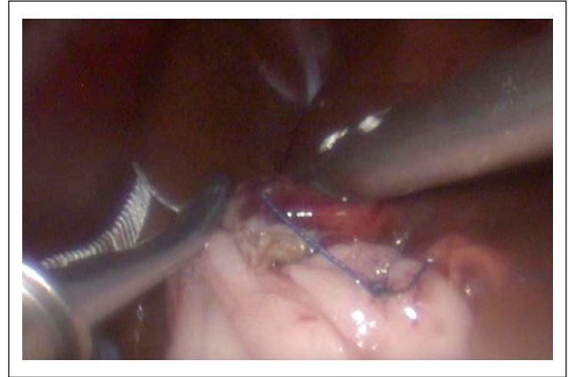
Figure 4 Omentopexy of the residual cystic wall using 4-0 USP in a simple interrupted pattern

The anaesthetic recovery was uneventful and the cat was hospitalised for 12 h. Postoperative care in our hospital included close monitoring, Ringer's lactate fluid therapy, methadone 0.2 mg/kg SC q6h, which was changed to 20 µg/kg buprenorphine SL q8h for 3 days after discharge, and continuation of amoxicillin-clavulanic acid 20 mg/kg PO q12h for 4 weeks for the urinary infection.