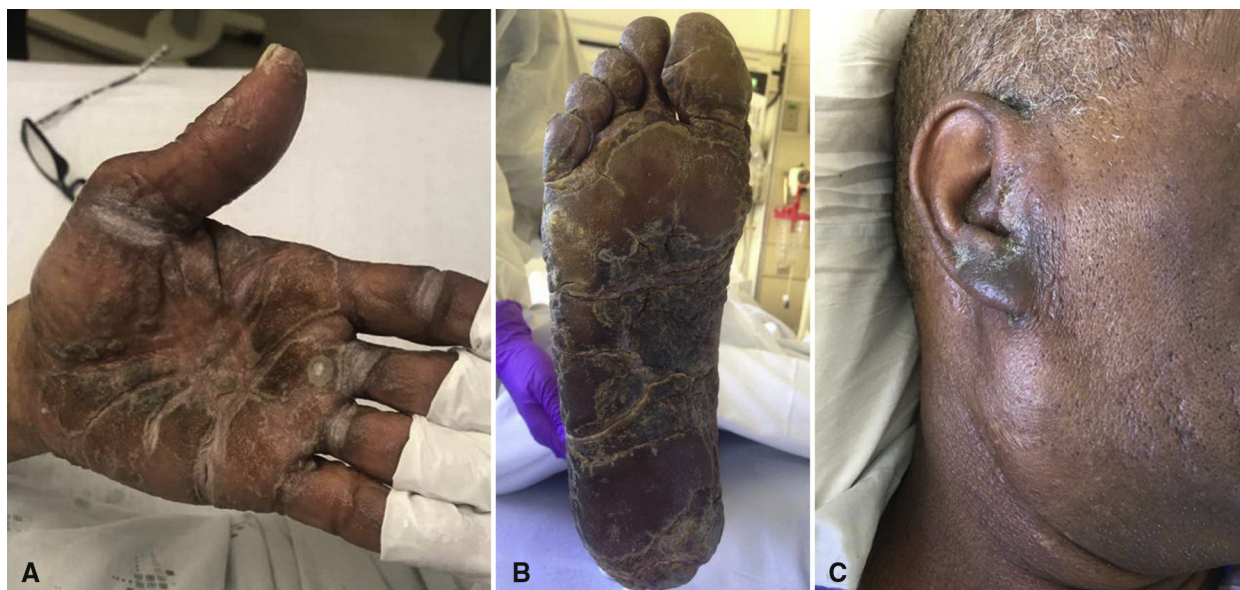
Fig 2. Clinical image taken at time of hospitalization. A , Hyperkeratotic plaques and fissuring of left palm. B , Hyperkeratotic plaques and fissuring of right plantar foot. C , Hyperpigmented plaque over right ear.

and massive firm adenopathy of the cervical and inguinal nodes (Fig 2, A, B, and C). The patient was subsequently admitted to the hospital for intravenous antibiotics and further workup.