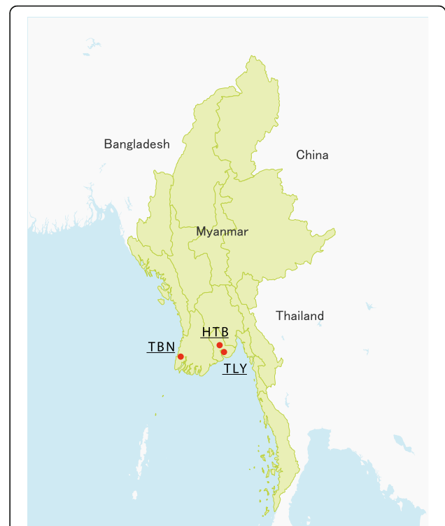
Fig. 1 Stool sampling locations in Lower Myanmar. HTB: Htantabin, TBN: Thabaung, and TLY: Thanlyin

Htantabin Township is located on the western border of central Yangon Region, Myanmar. There are 59 village tracts in the township consisting of 230 villages. Overall population is 120,454 (2008). Thabaung is a town in the Patheingyi District, the Ayeyarwady Division of south-west Myanmar. There are 70 village tracts in the township consisting of 421 villages. Total population is 154,400 (2014). Thanlyin is a major port city of Myanmar,