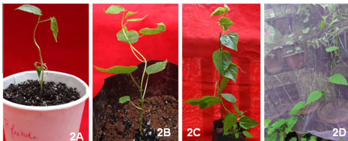
Figure 2 (A–C) Hardening of plantlets in the green house. (D) Hardened plant in the field conditions.