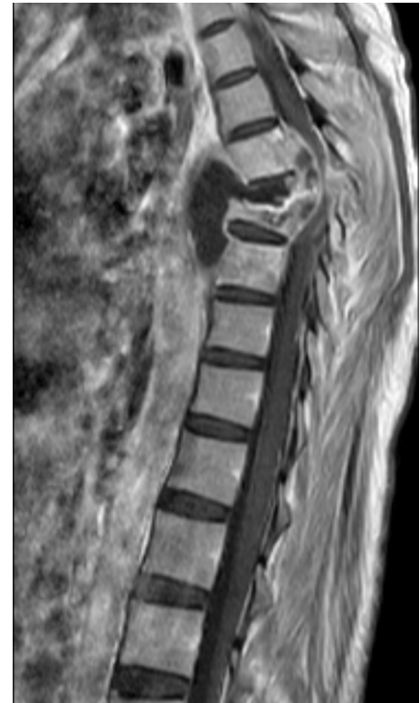
Figure 2 MRI of a thoracic spine showing compression of T7 and T8 vertebrae along with discitis at T7–T8 level, prevertebral abscess extending from T6 to T9 level, and contrast enhancing soft-tissue density (epidural abscess) in the anterior aspect of cord from T6 to T8, compressing the spinal cord.

Lumbar puncture revealed xanthochromic cerebrospinal fluid (CSF) which coagulated within