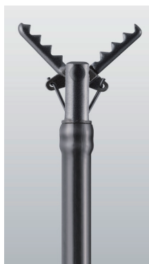
Figure 1 Clutch Cutter is a scissor-type device for endoscopic submucosal dissection.

with other knives (ESD-O) by using propensity score matching analysis, which compensated for differences in extraneous factors including baseline characteristics [2] . We hypothesize that the outcomes using ESD-C will be superior to those of ESD-O.