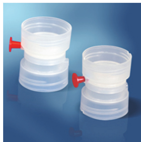
FIGURE 1: Filter device utilized for sequential extraction of Ni's fractions (DigiFILTER 0.45 micron, SCP Science, Quebec, Canada).

3.2. Determination of Nickel. The determination of different fraction of Ni were performed by atomic absorption spectrometry (AAS Spectra 400 Varian, Medical Systems, Inc. Palo Alto, CA) equipped with a transversal Zeeman-effect background correction system and an auto sampler was used