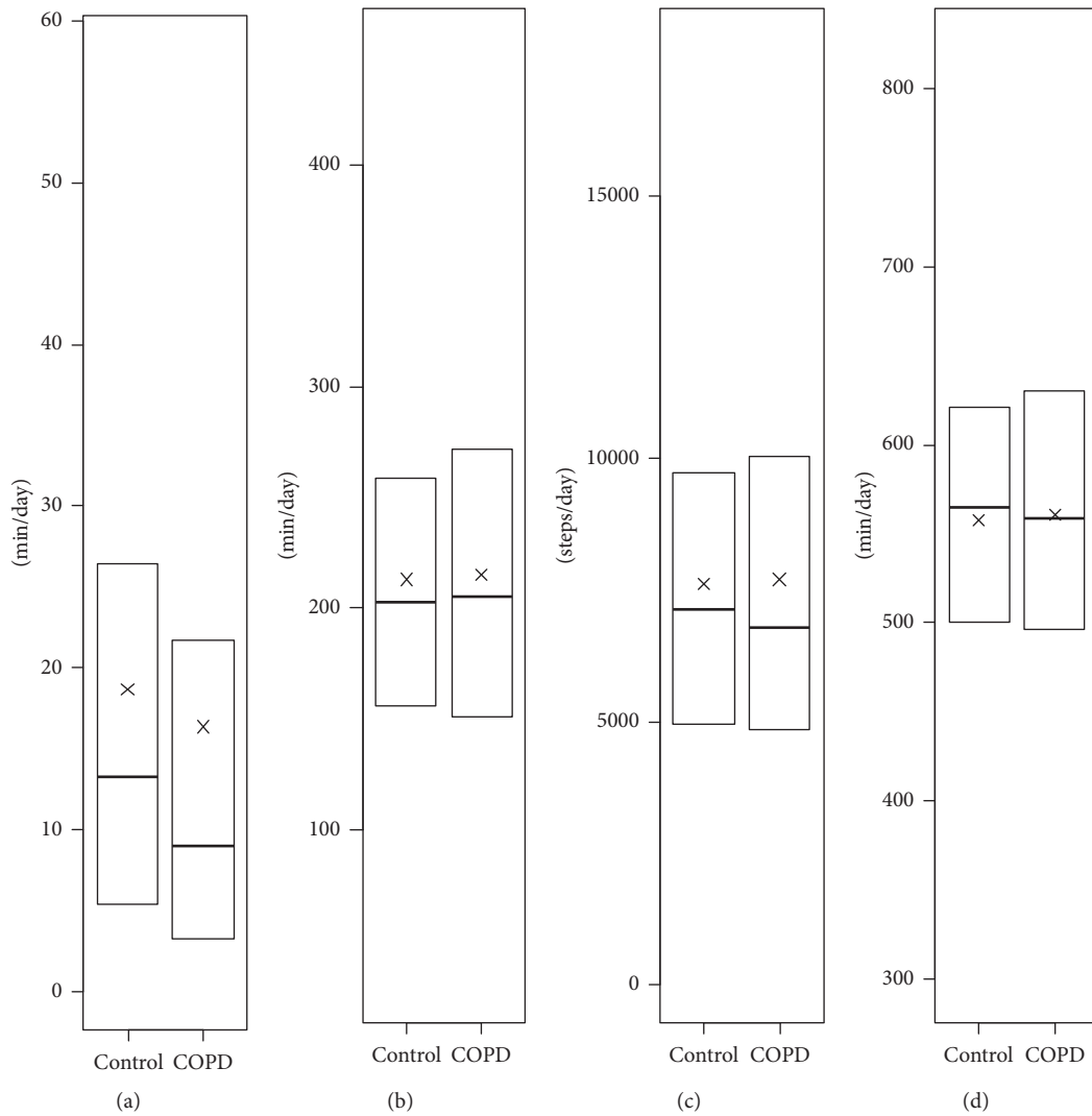
FIGURE 1: Daily physical activity and sedentary in participants with and without COPD. (a) Moderate and vigorous physical activity (MVPA). (b) Light physical activity (LPA). (c) Steps. (d) Sedentary. x = mean. The whiskers are voluntary missing because Statistics Canada does not allow figures with individual data representation.