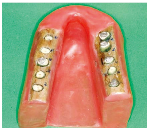
Fig. 1. A photograph showing the phantom fabricated for the placement of teeth after tooth insertion.

Two pieces of cow rib bone with adequate thickness were fixed to both ends of a wax arch to simulate part of the mandibular body. Cavities simulating extraction sockets were created in it, and the tooth roots were placed in them and fixed in position (Fig. 1). Alveolar sockets were cre-