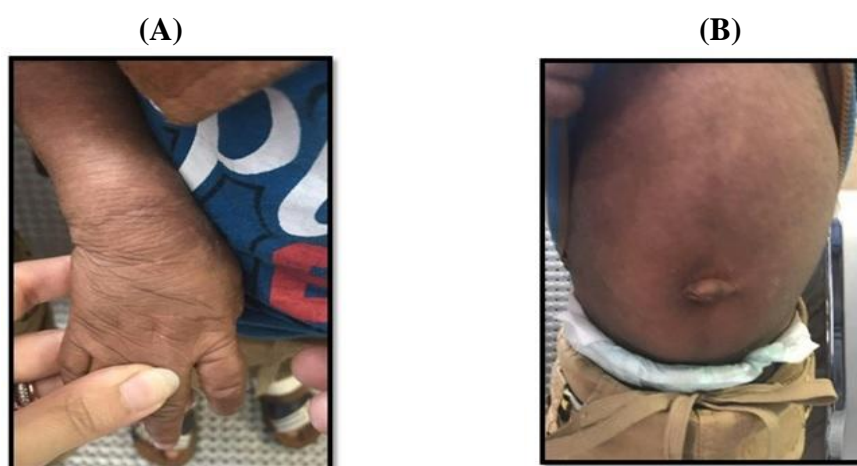
Fig. 1. Clinical findings. Ichthyosis (A) and hepatomegaly (B).

At the time of hospital admission, a significant ichthyosis and hepatomegaly (4 cm below rib edge in midclavicular line) was observed; however, no other signs and symptoms were detected. Growth and motor development milestones were normal according to the WHO standards [5] . Also, patients had normal muscular tone, and no eye and heart complications were detected. In primary investigations, heart, liver, and renal functions were normal. They only exhibited a mild increase in alanine transaminase (ALT) and aspartate transaminase (AST) levels, which were about 58 U/L and 63 U/L, respectively. Also, serum lipid profile for both patients was normal, except for triglyceride level, which was about 280 mg/dl.