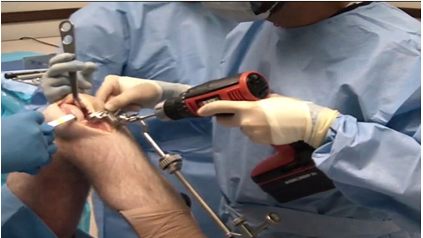
Figure 2. Setup during conventional UKA procedure.