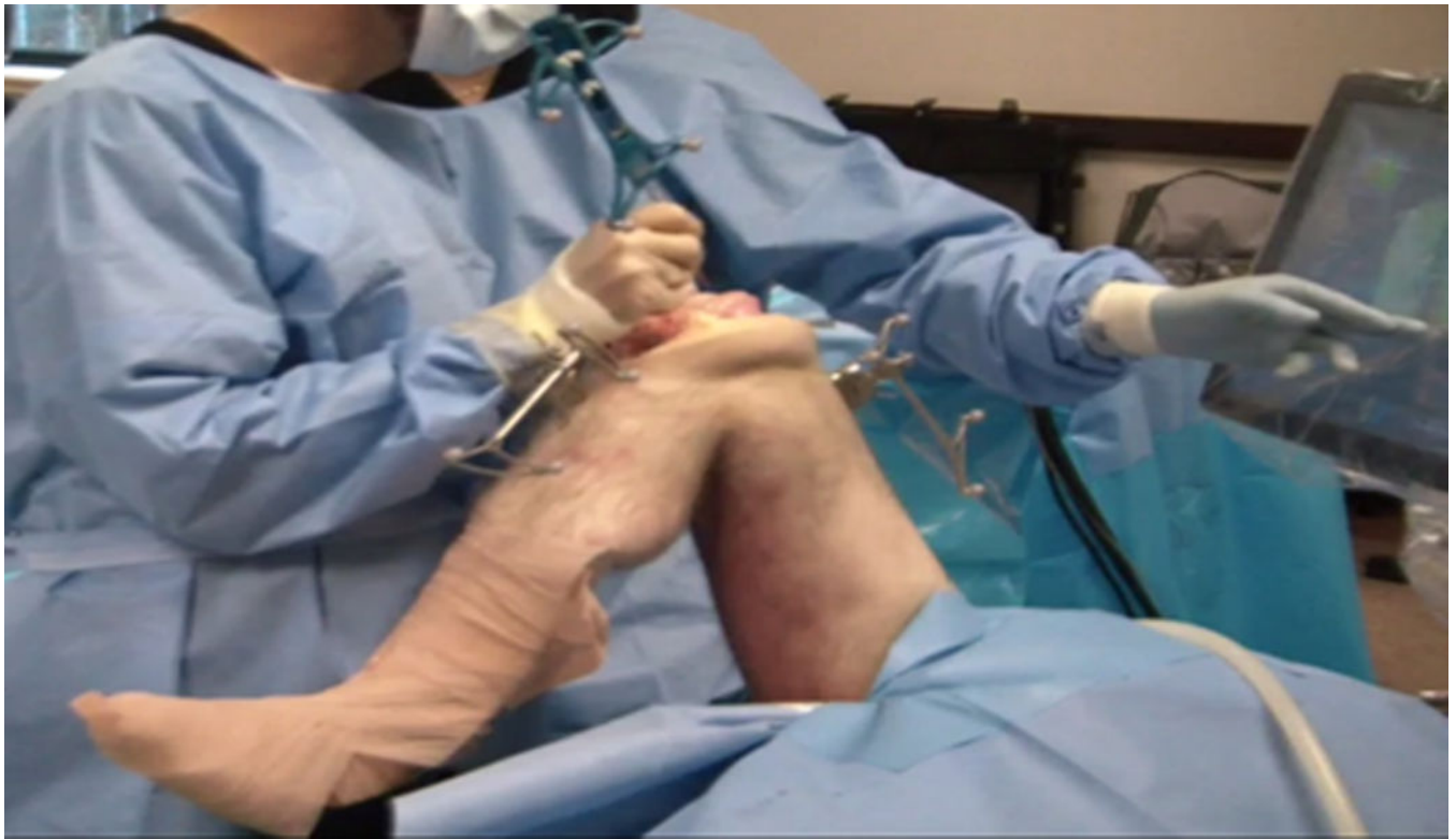
Figure 1. Setup during a robotically navigated UKA procedure.