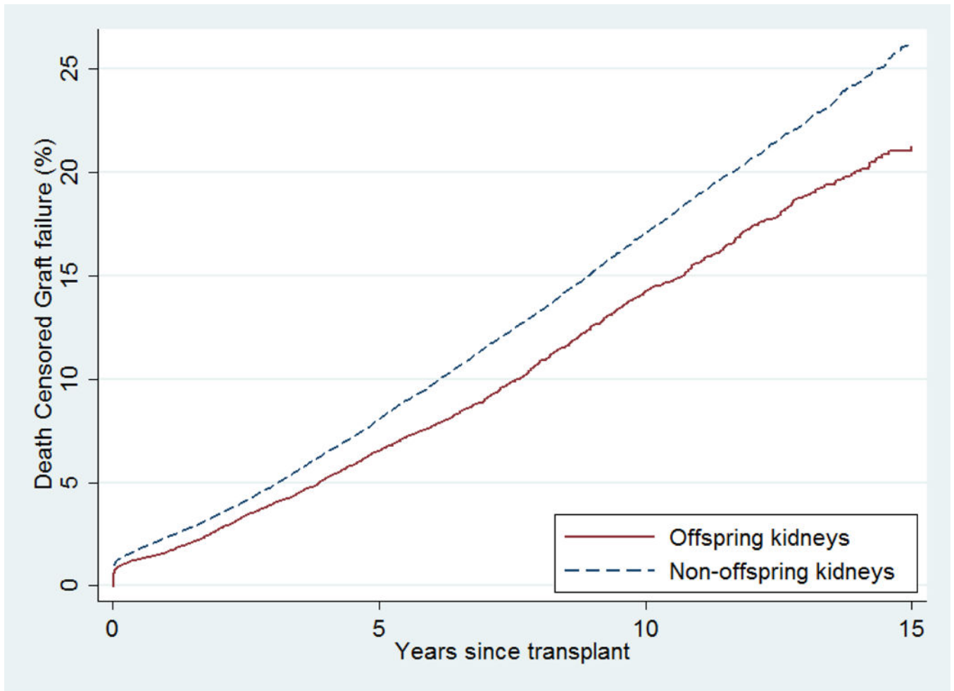
Figure 3. Cumulative incidence of death-censored graft failure after offspring living donor transplants and non-offspring living donor transplants.

Recipients of offspring kidneys had lower DCGF than recipients of non-offspring kidneys (crude 15-year DCGF: 21.2% vs 26.1%, p < 0.001 ). After adjustment for recipient factors, offspring kidneys were associated with 23% lower risk of DCGF (aHR 0.73 0.77 0.82 , p < 0.001 ).