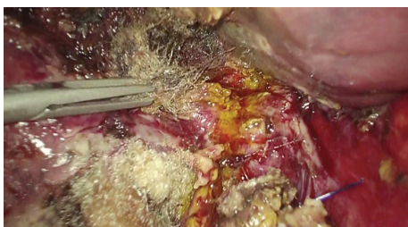
FIGURE 2: Duct of Luschka.