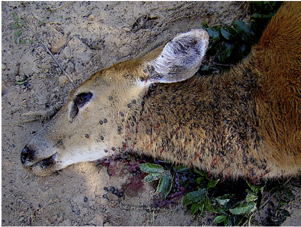
Fig. 3. Dead marsh deer with high tick burden.

the Argentine Ministry of Science and Technology (PIP 11220120100108CO, CONICET and PICT 2015–2001) and INTA PN BIO (1131043 and 1131032). MMO and MDF are members of CONICET Researcher's Career.