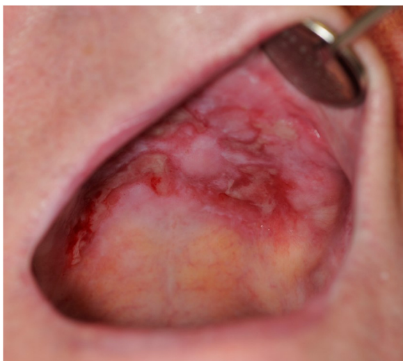
Fig. 1. Photographic representation of erosive oral lichen planus at presentation. Significant oral mucosal ulceration is demonstrated affecting both the hard and soft palate.