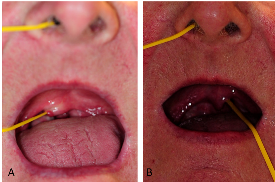
Fig. 3. Photographs to depict the technique of 'nasal flossing': The silastic sling is introduced through the anterior nares, along the nasal floor and over the superior border of the soft palate before being pulled out through the mouth. This sling allowed gentle traction to be applied to the soft palate so that it was pulled away from the inflamed posterior pharyngeal wall and could also be manoeuvred medially and laterally to free up any early adhesions that had formed. A – Insertion of the sling. B – Lateral movement of the sling.

up and preparation of this report. No further surgical intervention has been required at three years