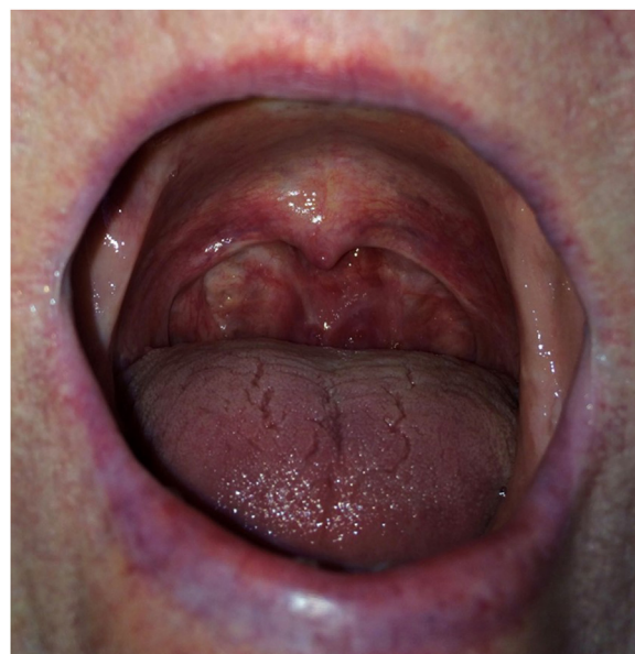
Fig. 2. Photographic representation of response to medical therapy. The oral ulceration has largely resolved but the patient still complains symptomatically of nasopharyngeal stenosis.

intervention. This work is reported in line with SCARE criteria [13]. The patient was managed in the private practice.