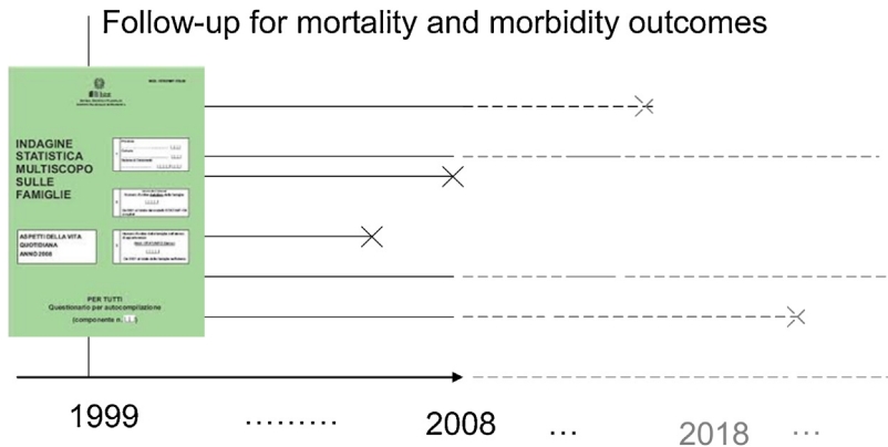
Fig. 2. Graphical representation of the cohort together with the follow-up.

investigated the following specific causes: lung cancer (ICD-9 code 162), bladder cancer (ICD-9 code 188), kidney cancer (ICD-9 code 189), diabetes (ICD-9 code 250), Parkinson's disease (ICD-9 code 332), Alzheimer's disease (ICD-9 code 331), myocardial infarction (ICD-9 code 410), angina pectoris (ICD-9 code 413) atherosclerosis (ICD-9 code 440), LRTI (ICD-9 code 466, 480–487), COPD (ICD-9 code 490–492, 494, 496), asthma (ICD-9 code 493), and miscarriage (ICD-9 code 634).