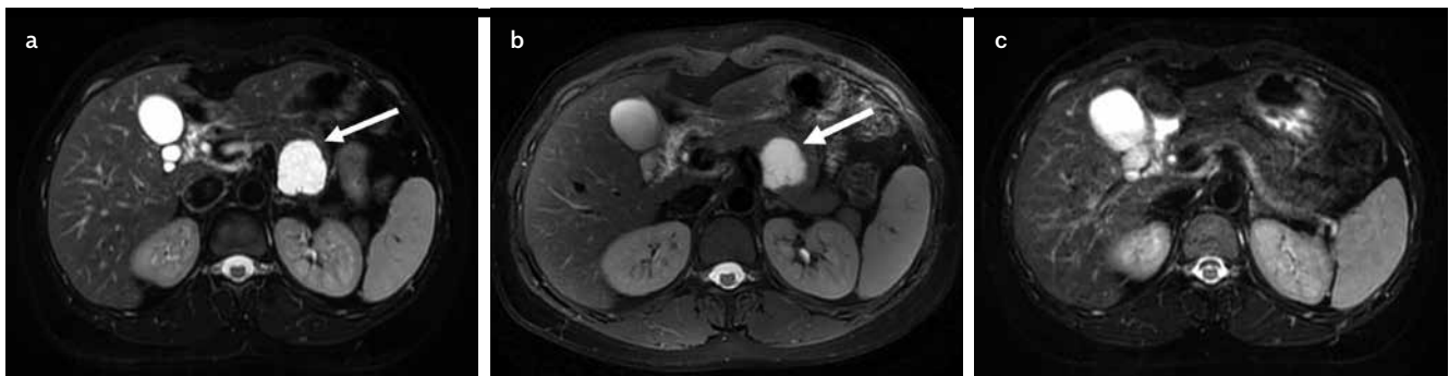
Figure 3. a-c. MRI examination: (a) pretreatment, a cystic lesion 3.5 cm×3.0 cm×3.1 cm in size; (b) a month after the EUS-RFA, the size is 3.5 cm×3.0 cm×3.1 cm; (c) 3 months after the combination treatment, the lesion disappears

The EUS-RFA combined with lauromacrogol ablation seems to be another reasonable strategy for improving minimally invasive treatment outcomes of PCNs. However, the safety, efficacy, and optimum indications still remain to be investigated in a large and long-term follow-up study with different PCNs types and sizes.