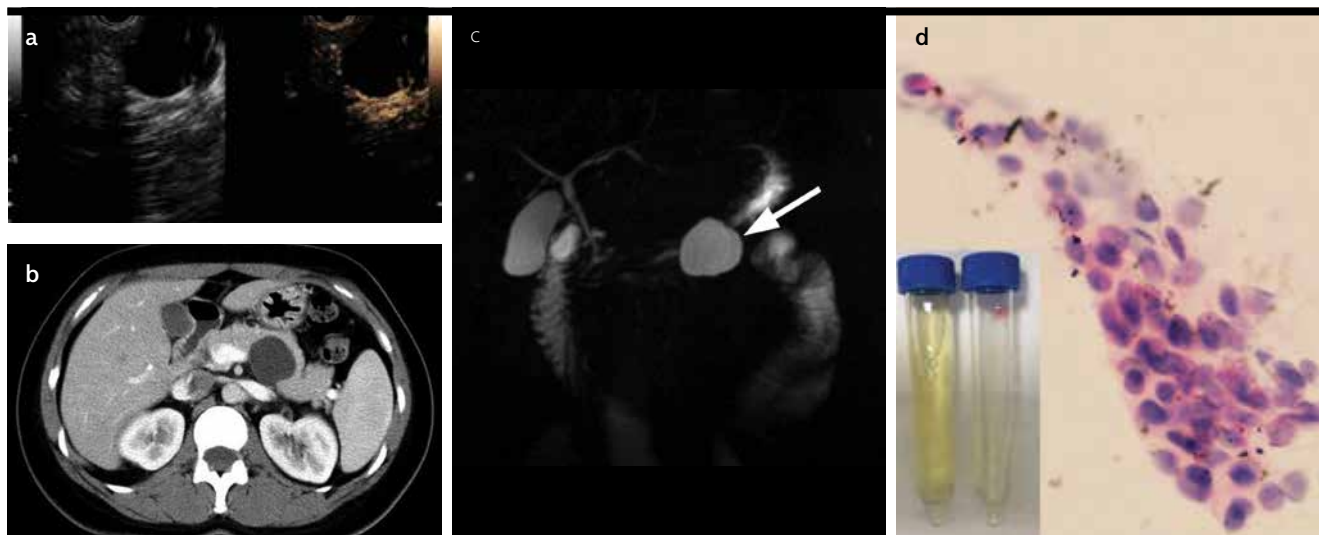
Figure 1. a-d. Pretreatment images: (a) Endoscopic ultrasonography (EUS) shows the cyst is septated without solid components, and contrast-enhanced EUS (CEEUS) reveals that the cystic wall and septa are enhanced; (b) computed tomography (CT) shows one cystic lesion with clear border in the tail of the pancreas; (c) magnetic resonance cholangiopancreatography (MRCP) reveals no communication between the lesion and the pancreatic duct; (d) the aspirated fluid from the cyst is clear and transparent, and the cytological examination of the fluid showed cuboidal epithelial cells without mucin vacuole (Hematoxylin-eosin stain; original magnification, x400)

catheter (Emcision Ltd, London, UK) with 8W of power for 2 min in each place (Figure 2a, Video 1). After 2 months, EUS showed the maximum section size 2.8 cm×2.5 cm, and CEEUS revealed cystic wall enhancement without septa enhancement (Figure 2b). Then 10 ml of 1% lauromacrogol (Tianyu Pharmaceutical Co. Ltd, Shanxi, China) were injected into the cyst, followed by a triple lavage, and finally 10 ml were retained in the cyst (Figure 2c, Video 1). After 3 months, MRI revealed the neoplasm disappeared (Figure 3). There were no adverse events during and after the procedures.