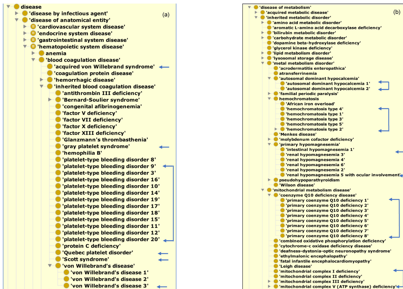
Figure 3. Example areas of term expansion: (A) hematopoietic system diseases and (B) inherited metabolic disorders. Blue arrow indicates new DO terms.

Note: The file, doid-non-classified, is an equivalent file (in content and structure) to HumanDO.obo. The DO project has continued to produce the HumanDO files, as this was the original naming convention used by the project for ~10 years and was included in several publications. Total class counts include non-obsolete and obsolete DOIDs (DO identifiers). OBO Foundry ( http://www.obofoundry.org ) (22). For DO's GitHub release # 45, there are 9,069 DOIDs, also retrievable from the DO's website.