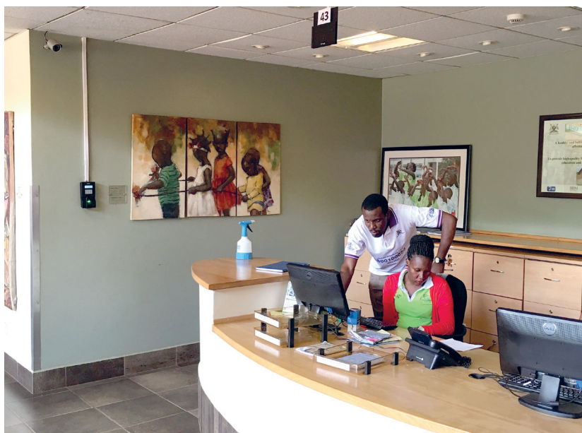
Photo: Reception at a hospital in Uganda (from the collection of Wu Zeng, used with permission)

Current measurement of QoC is a static process, where health facilities are evaluated against a set of checklists. Once health facilities meet the criteria for particular indicators, there is no incentive for them to