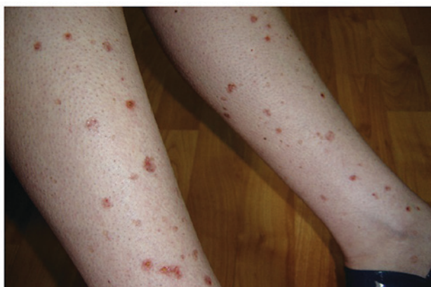
Figure 2. Clinical aspect on the lower legs. Multiple palpable round-ovular purpuric lesions, erosions and ulcerations.

was not possible. Skin biopsy was performed. The histopathology revealed a dense perivascular neutrophilic infiltration, fibrinoid necrosis of the vessel walls, leukocytoclastic and red blood cell extravasation, confirming the diagnosis of cutaneous leukocytoclastic vasculitis (Figs. 3 and 4). The appearance of cutaneous vasculitis was attributed to erlotinib toxicity. The administration of the drug was discontinued and oral prednisolone treatment was introduced at 1 mg/kg body weight dose for two weeks, decreasing the dose with 5 mg, at every 3 days. The treatment was combined with topical potent steroid and antibiotic therapy used once, daily. The lesions cleared within 7 weeks without recurrence. The treatment with erlotinib was restarted after 14 days with a lower dose of 100 mg/day, based on the literature data (4). The skin lesions have not recurred. Unfortunately, the evolution of the metastatic lung cancer was unfavorable. At 3 months after vasculitis healing, the patient died due to the complications of new metastases that occurred.