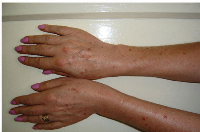
Figure 1. Clinical aspect dorsal on the forearm. Multiple palpable round-ovular purpuric lesions, erosions and ulcerations.