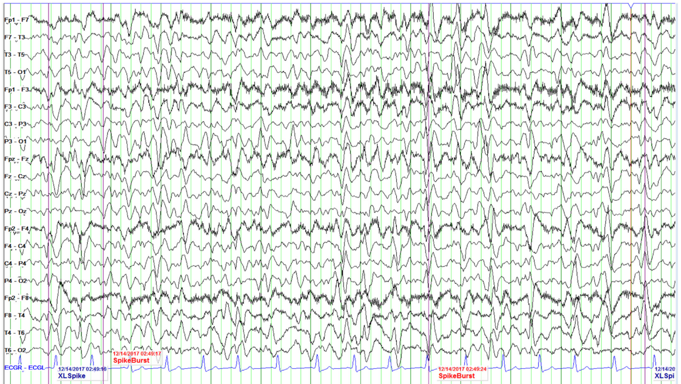
Fig. 1. Trend EEG revealed generalized 5–6 Hz theta with admixed 2–3 Hz delta frequency slowing. There was evidence of multifocal, independently occurring, sharp waves in the bilateral cerebral hemispheres occurring most prominently with stimulation. With stimulation, discharges occur with 1–2 Hz periodicity. Additionally, frequent generalized triphasic waves were seen. Triphasic waves were seen in addition to generalized slowing of the background activity. These collective findings in the setting of underlying diffuse cerebral dysfunction suggested the potential for seizures to arise.