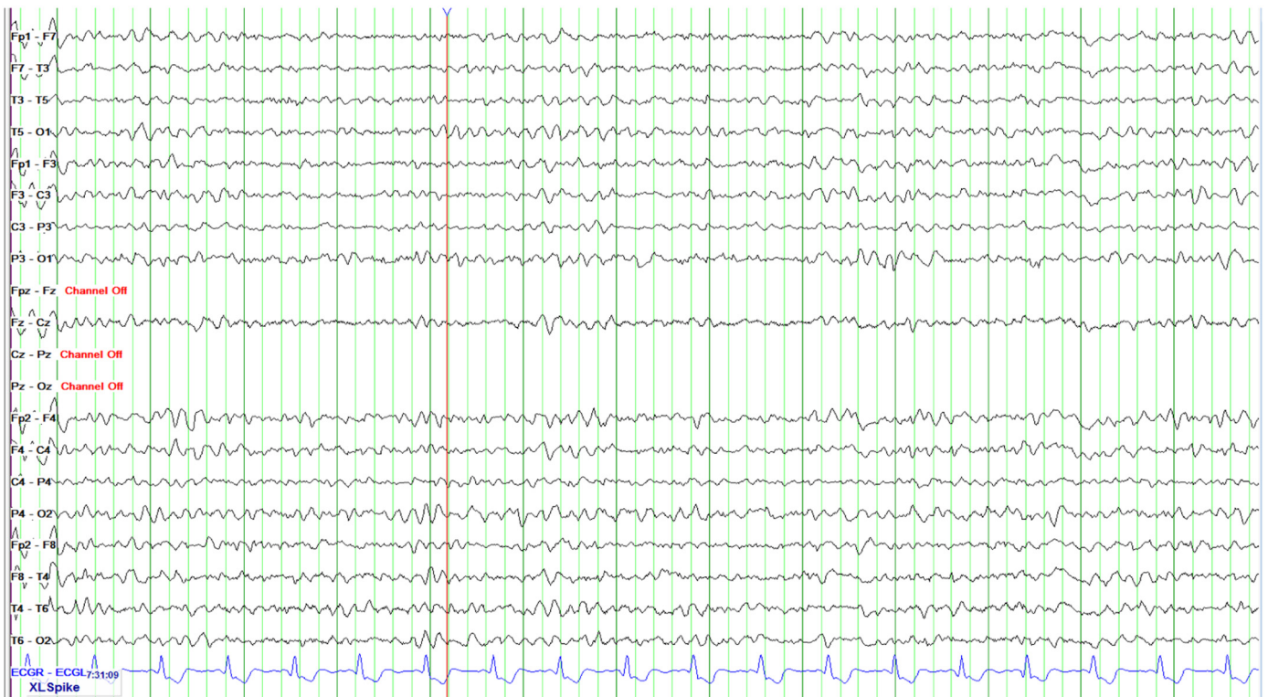
Fig. 2. Trend EEG shows dramatic improvement after levetiracetam administration.