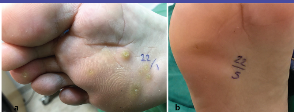
Figure 3: Multiple plantar warts (a) before treatment with the intralesional measles-mumps-rubella vaccine and (b) complete clearance after five sessions of treatment.

Flu-like symptoms, which occurred within 12 hours of injection and resolved within 24 hours spontaneously, were observed in 13% of the patients.