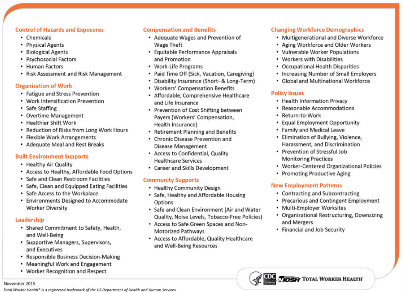
Figure 1. Issues relevant to advancing worker well-being through Total Worker Health.