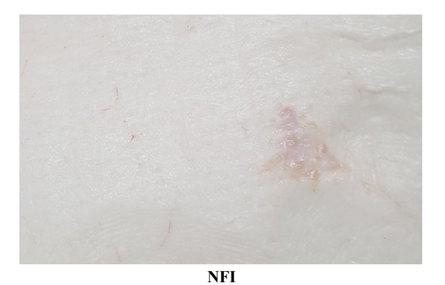
Fig. 2. Lesions generated in the muscle (control) and subcutaneous tissue (NFI) of pork ham from pigs vaccinated with the FMD vaccine using a conventional syringe needle (control) or transdermal needle-free injection (NFI).