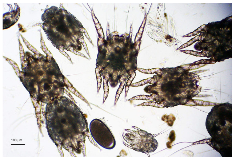
Fig. 1 Microscopic examination of the auricular secretion of a cat infested by different stages of O. cynotis

The study population consisted of 39 European breeds of cats (21 females and 18 males) divided in two groups (14 stray cats in study 1 and 25 owned cats in study 2), with weights ranging from 1.8 kg to 8.5 kg and between 1 and 8 years of age. Sixty days before treatment all cats were examined for clinical signs related to the presence of fleas and mites and suitability for the trial. All cats received a single dose (40 mg/kg) of fluralaner spot-on solution (Bravecto® spot-on, MSD Animal Health) on day 0. All treatments were applied by vets directly on the skin at the base of the skull, by squeezing the contents onto one or more spots according to the manufacturer's instructions. Cats were checked for 24 h after dosing with follow-up performed at 7, 14, 28, 56 and 84 days to evaluate the effectiveness of fluralaner (Table 3).