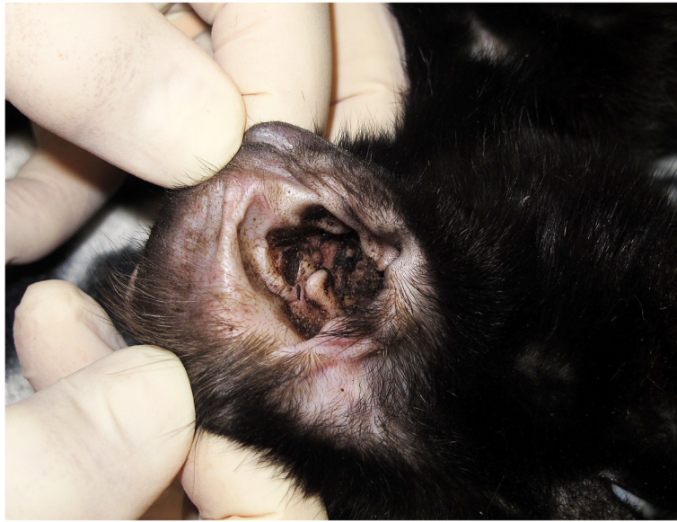
Fig. 2 Auricular secretion with a characteristic “coffee ground” appearance in a cat affected by otodectocosis