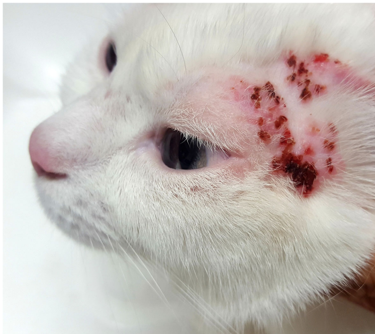
Fig. 3 Self-traumatism injuries due to Otodectes cynotis in an infested cat

Prior to enrollment, O. cynotis infestation was confirmed by direct or otoscopic examination of the external ear canal of both ears. On 28, 56 and 84 days post-treatment cats were sedated with dexmedetomidine hydrochloride