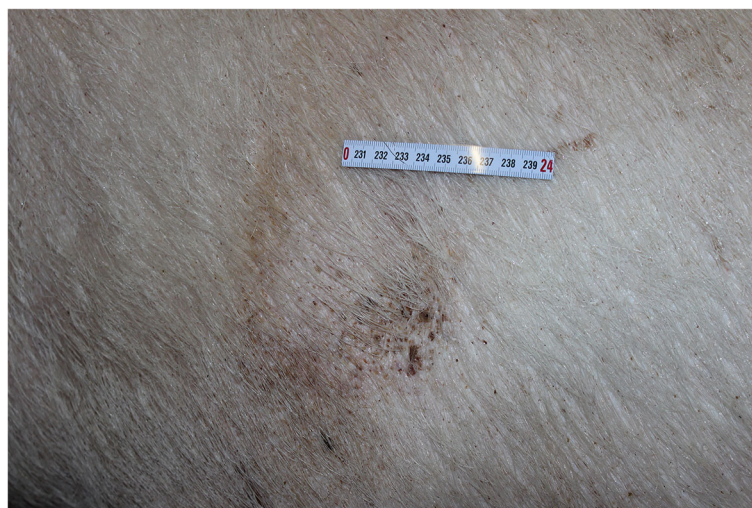
Fig. 1 Top view of the left shoulder of a sow with an ulcer stage 5 (scar tissue)

The absence of any epidermal and dermal alterations (Additional file 1) was characterising Score-H Stage 0. No traumatic neuromas were found.